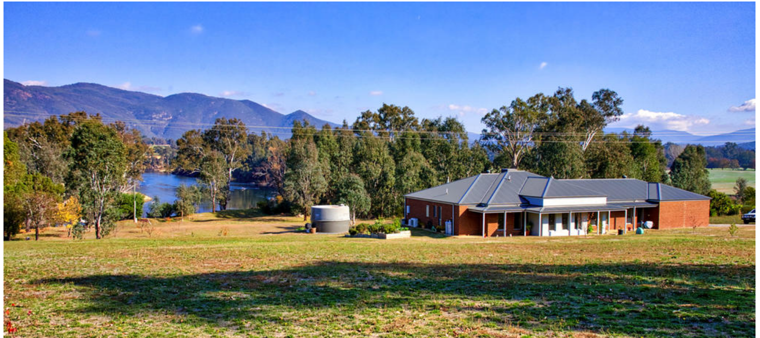
"Almisha" 5789 River Road, Talmalmo