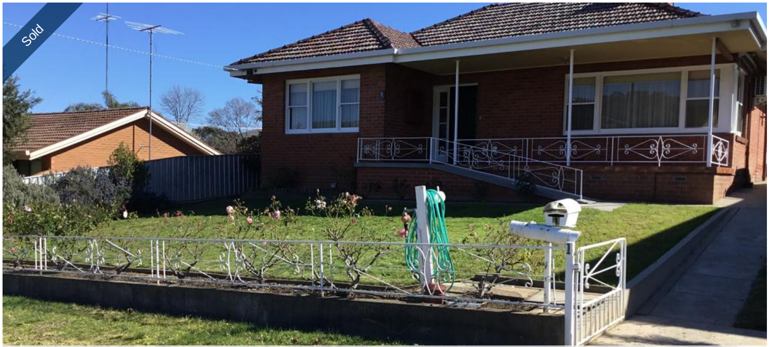
1 Willong St, Tallangatta